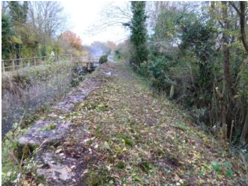
Lock 13 - Stainwith Lock (Note the spelling!)

We all have much to look forward to in 2021 so do not let Tier 4 depress you. Many of us should receive a vaccination before Easter; GCS has already commenced enhancement work on the canal at sites in Rushcliffe; new volunteers are arriving following news of our extended work area; and the Society and the Management at The Castle have agreed that the work-site at Lock 14 can remain operational for Lock 13 restoration in the future!