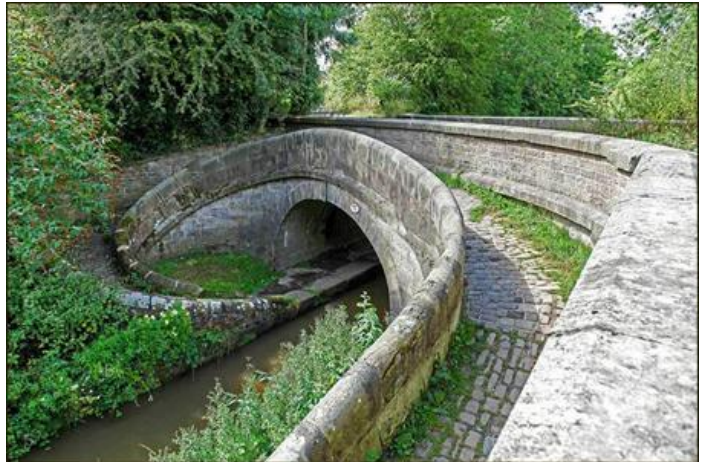
An example of a Roving Bridge - not on the Grantham Canal

The rope they used was quite a long one, and it was made of cotton, which happens to be denser than water. When two boats met, the one crew allowed their rope to go slack, causing it to sink to the bottom of the canal. The second horse stepped over the slack rope, the second boat floated over it, and then both boats continued on their way.