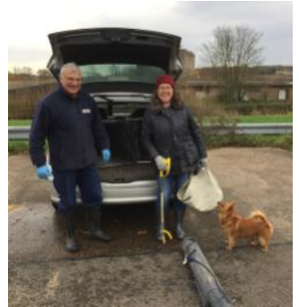
2 of our Earsfield Rangers