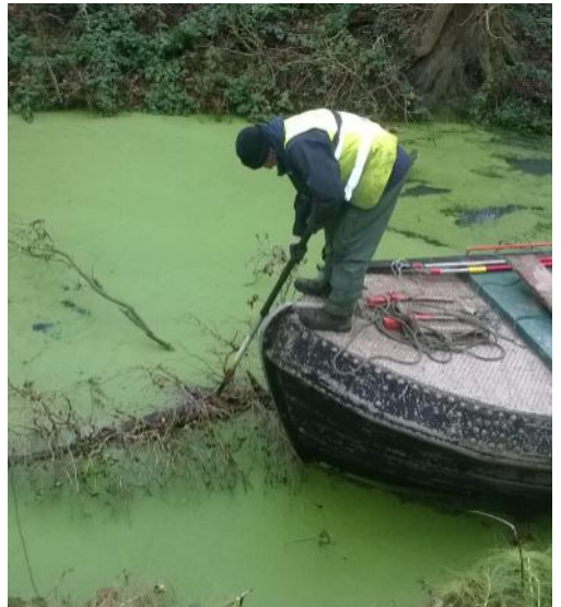
& tree clearing