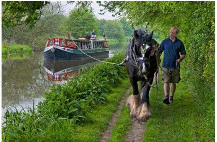
Passengers enjoy a leisurely boat trip along the Kennet and Avon Canal.