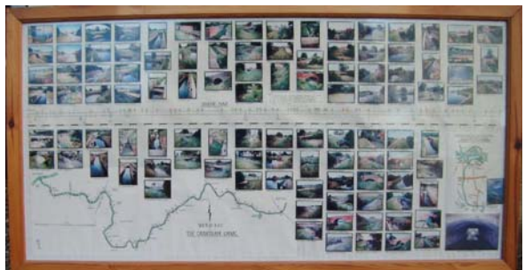
One of Bryan's display boards

During the early 1990s Bryan and Linda worked closely with David Lyneham-Brown on a project to restore 2.3 miles of canal from Hickling towards Hose. A Derelict Land Grant enabled the section to be fully dredged and 3 new steel swing bridges installed replacing the previously lowered brick built bridges. The project was completed in 1994.