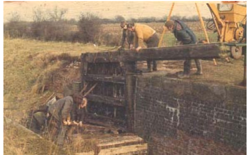
Photo four. This was one of the first attempts of the canal societies work party, poss 1971, after excavating the culvert at Fishpond Cottages the team cast a concrete layer over the brickwork with the hope of a permanent seal but it never did and this culvert still leaks today.

This shows us trying to refit the top gates we had recovered from the canal bed at Lock 9 using a Smalley crane on trial together with a normal Smalley. The idea being to re-flood that section with water being pumped from the nearby Gypsum mine. Unfortunately vandals set fire to the gates shortly after and BWB demolished the remains.