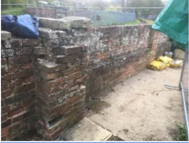
The adjacent 'Heritage' wall to be dismantled and rebuilt