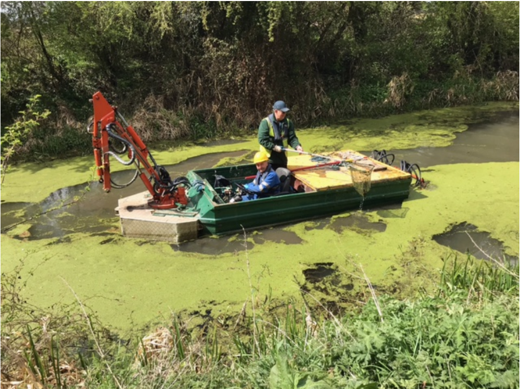
Otter on rubbish collection duties