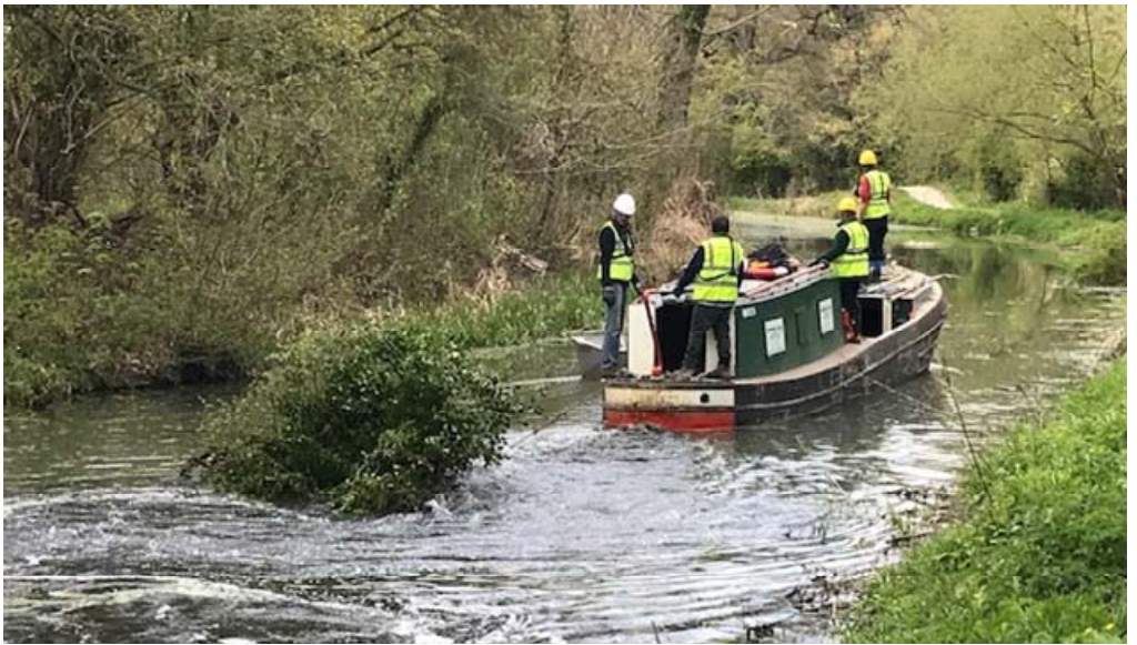
Centauri towing an ivy covered tree trunk to be cut up