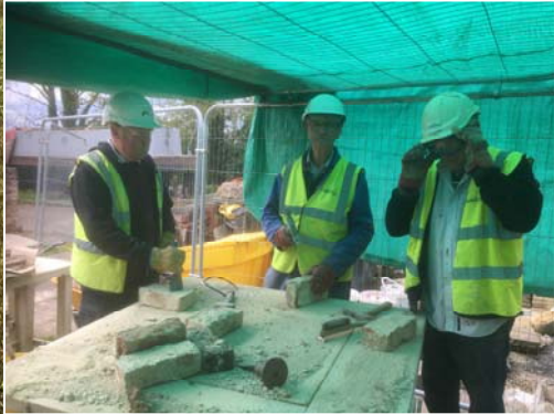
Brick cleaning again!