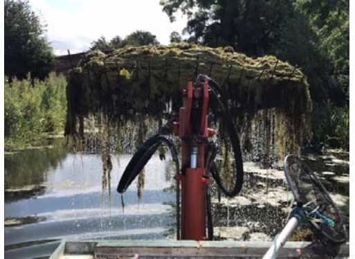
Weed gathering by Otter A never ending job!