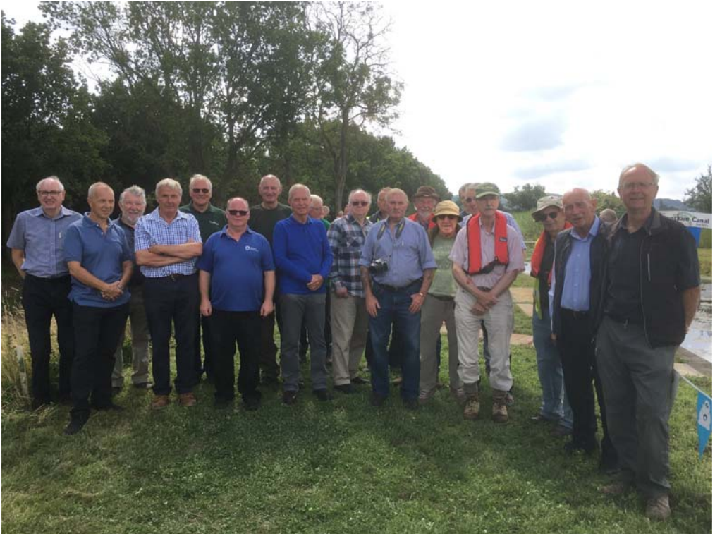
The Grantham Canal Society's Team who helped rebuild Kingston's Lock (lock 14)