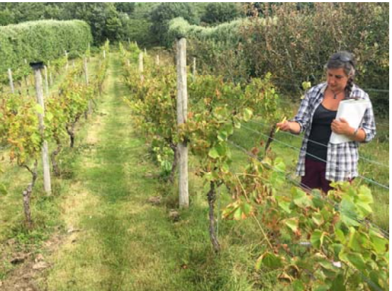
Assessing the damage after