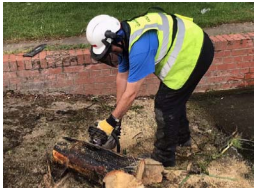
The log's demise Never to offend again

Some photos from various GCS members indicating the numerous tasks our volunteers undertake on a regular basis.