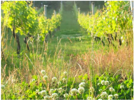
Healthy vines before the storm

Those crops which have survived the storm are now feeling increasingly precious, so our next job will be dragging out and installing the nets which keep the birds away from the ripening grapes. We left this too late in our first year and the resident blackbirds, thrushes and starlings had already settled themselves in for an autumnal feast. Once they'd had that first taste, they were intent on working out how to break back in, so this year we're hoping to get the nets on before they start!