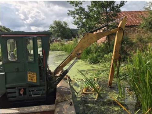
Mudlark in action