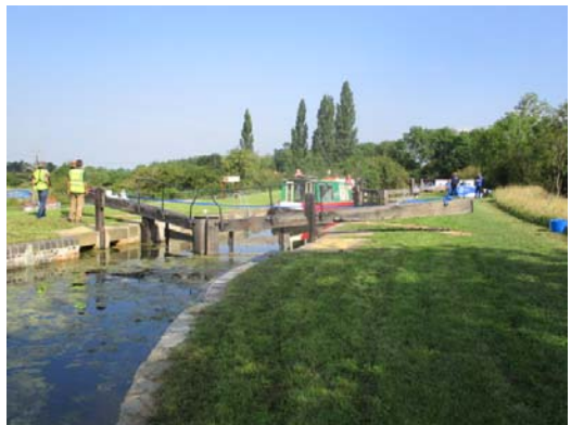
Gates open The Three Shires prepares to leave the lock