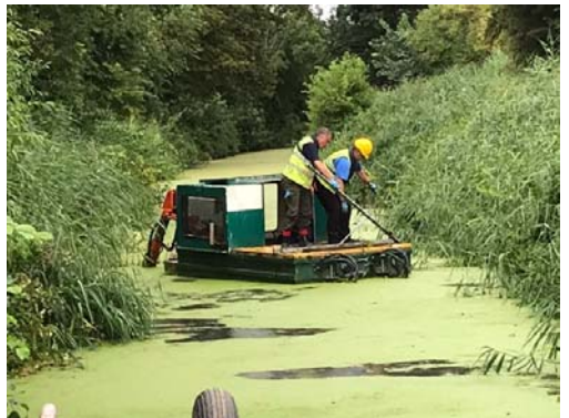
Log hunting in Otter Finding the elusive prop killer log