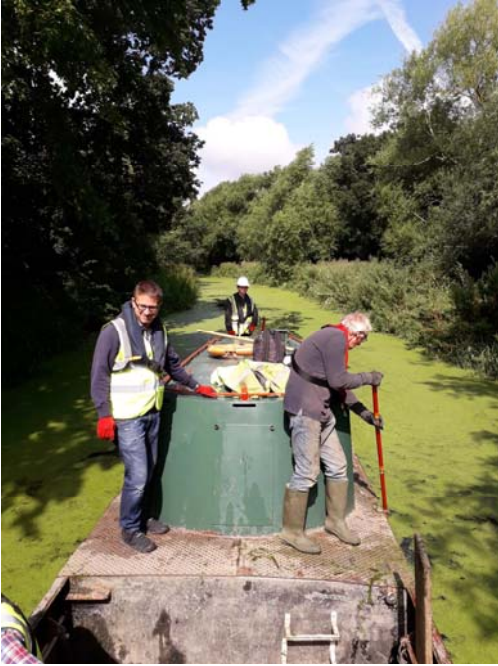
The Hunter/Gatherers return on Centauri