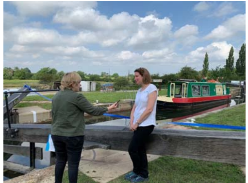
CRT Project Manager being interviewed by BBC Radio Lincolnshire