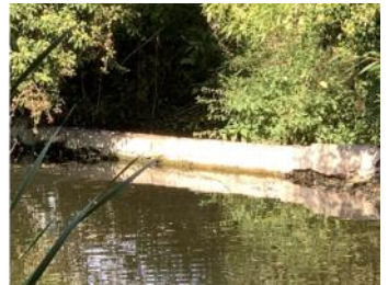
Very Low Level at Overflow Weir

I'm very happy to say that the Grantham Canal Society (GCS) along with the Canal and River Trust (CRT) have plans in place to repair the leaking culverts and have already started work on some. More of the dry section between Owthorpe and Cropwell Bishop will be cleared over this period.