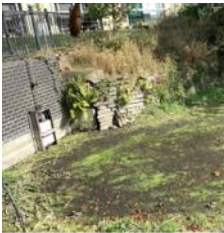
Inlet to Trent Lock 1

In addition to the water provided by these reservoirs the canal is topped up in a number of places along its route by streams. The majority of the water is lost through broken culverts through which streams and smaller rivers pass. These were constructed at the time the canal was originally cut in the 1790's and are mainly built of brick. Damage by dredging, plant and tree roots have caused leaks over the years, a great deal of repair work is needed. Here are a few photos of the canal in Lady Bay taken on 26 September 2021.