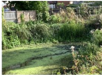
Trickle from culvert at Bridge 3