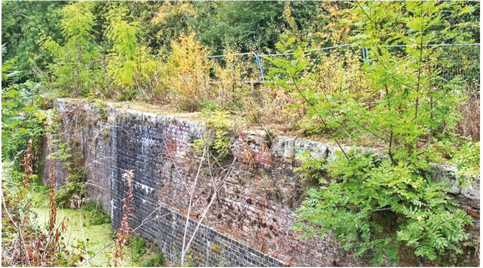
30 September: a lot of work done clearing grass etc and self sets around Lock 13 and opening access to the Sustrans route which will allow further surveying for future restoration.