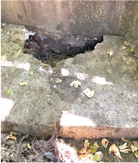
Hole to be filled