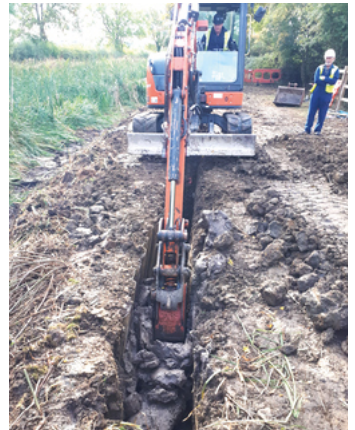
That's a lot of puddle clay! and (right) the clay being compacted into a trench to prevent water ingress