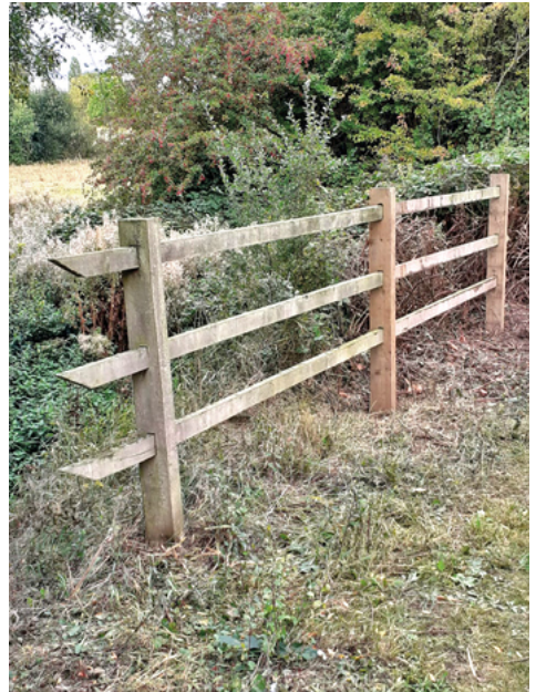
24 September: fence job at Irish Jacks bridge and Culvert 39. Above the culvert, 2 of 3 fence posts had rotted through. The fence protects an 8ft drop into the stream bed so the posts had to be replaced before the planned start of the culvert and leak works.