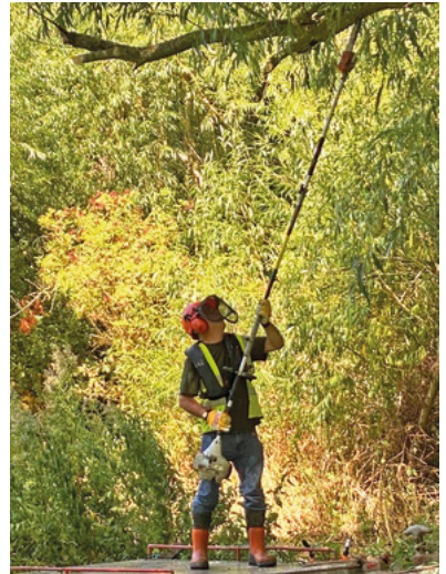
Pole sawing in the Amazon? (19 August)