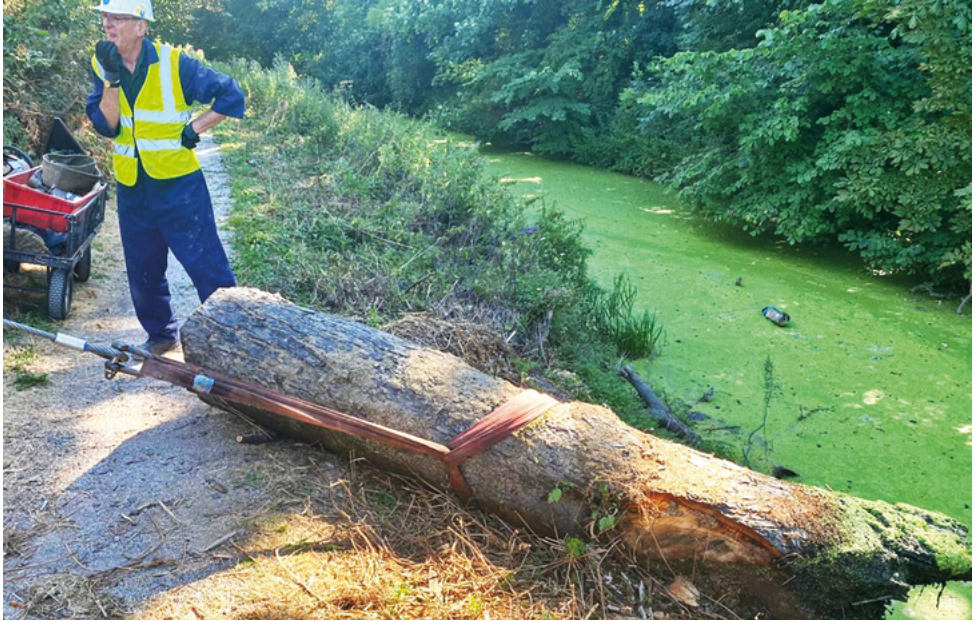
Tree trunk removed 5 August

A bunch of photographs from our unpaid volunteers working hard to maintain, refurbish and restore this wonderful canal, broadly covering the last three month's efforts. I could easily fill this entire magazine with their images. Ed