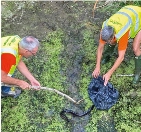
Eel rescue at a dry Lock No 2 on 13 August