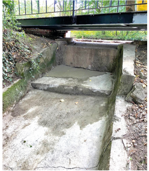
Job done! 16 Sept