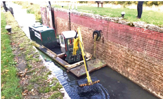
Mudlark on silt removal duties at Lock 16, 28 October