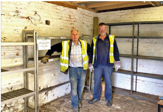
Above and left, work continues on the workshop at the depot (21 October)