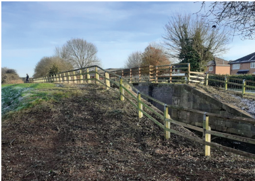
A very tidy-looking Lock 3 at Gamston (10 Dec 2022)