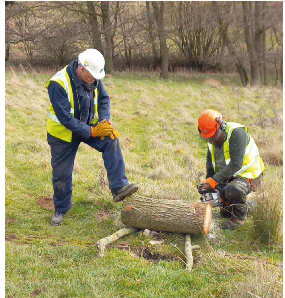
A bit of precision trimming to make a stopper for the hole where the lambs fall into the culvert at Knipton feeder - Fri 10 Feb

It certainly is down on the canal! The sheer diversity of the works carried out by our volunteer workparty and construction teams is immense: from bilge clearing (ugh!) to removing the seemingly never-ending floating debris (both natural and human-derived variety) that accumulates in the canal and from engineering projects like lock restoration to logging operations that might rival those on the Amazon. Of course we do plant trees as well as remove them!