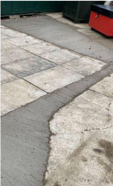
Construction work continues at improving and enhancing the Depot (photos from Fri 13 Jan 23)