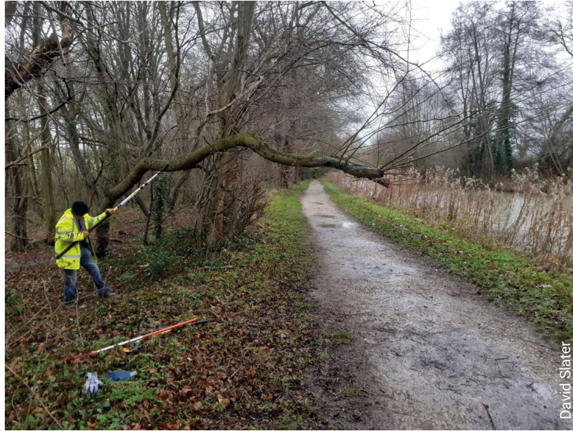
Removal of a low hanging branch above the towpath near Denton weir (Sat 7 Jan 23)