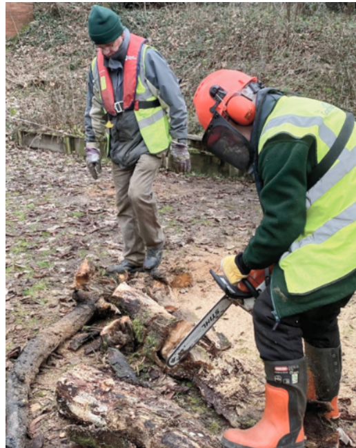
Left: chainsaw action on Fri 6 Jan and (above) at Harlaxton Fri 13 Jan