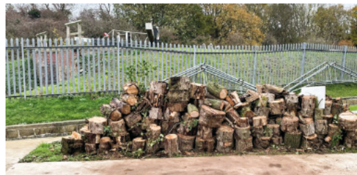
Fully loaded Centauri and the van with a good stack of logs piled up at the depot.