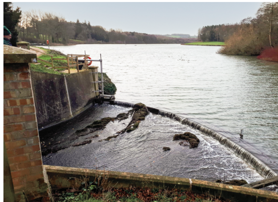
Knipton Reservoir on a cold & frosty January morning