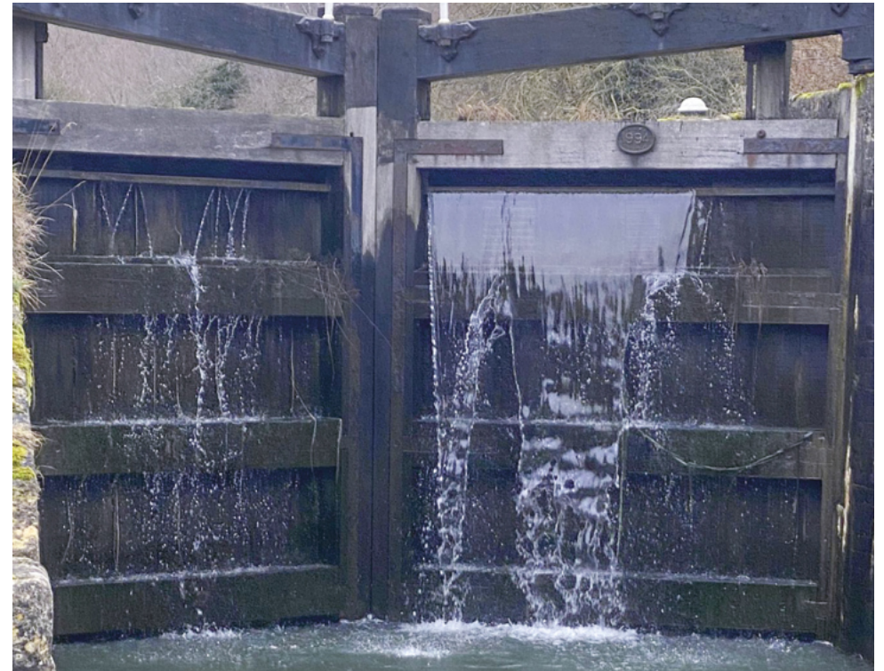
Great photo by Alec Hampson of the canal water spilling over the gates at Lock 17 (1 Feb 2023)