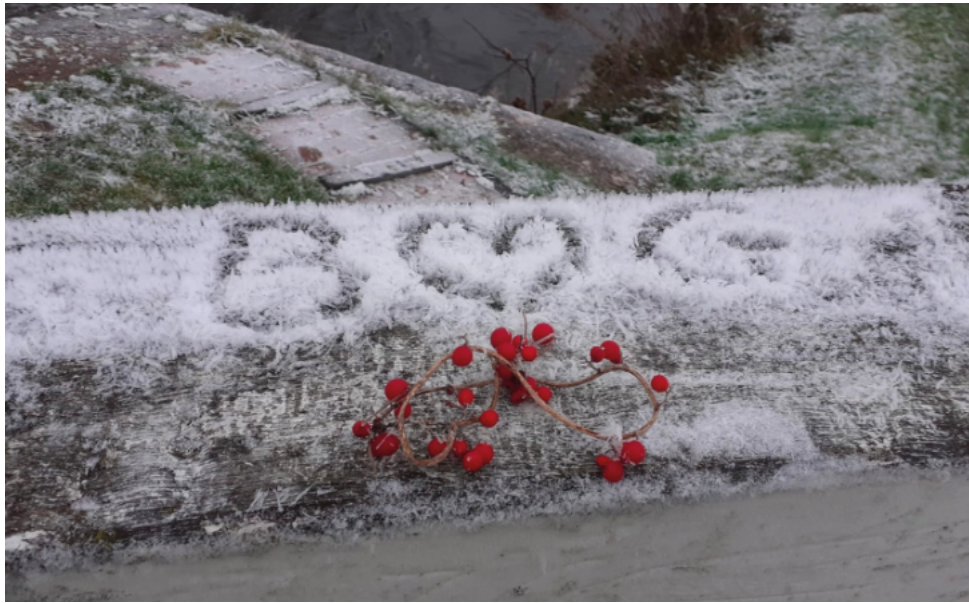
Love on a Cold Canal? Spotted at a frosty Lock 18 on 12 Dec 2022