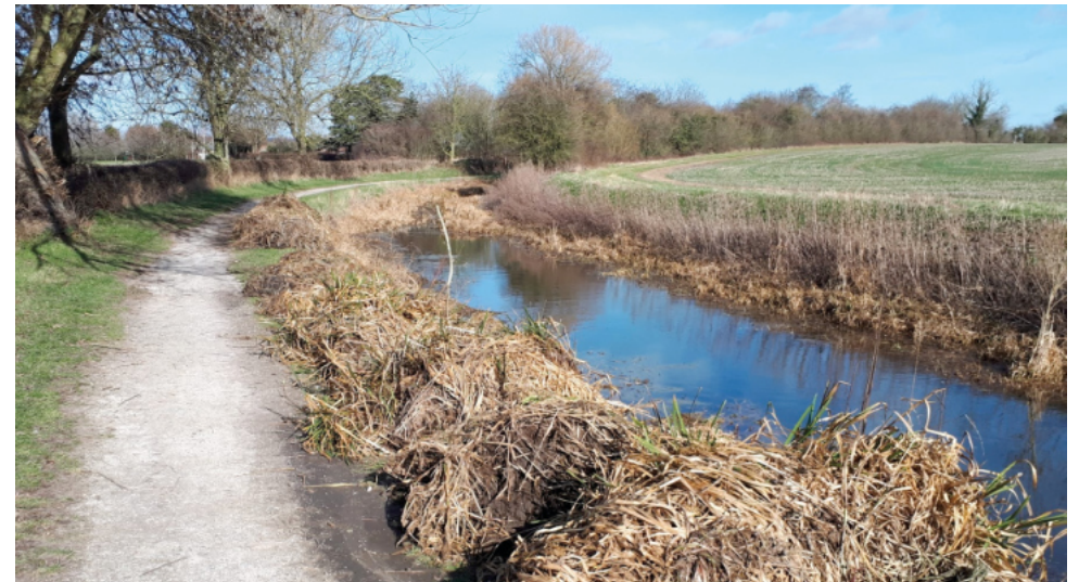
Start of reed clearance east of Hickling Basin (19 Feb 2023)