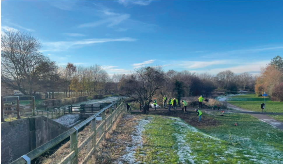
Clearing the surrounds of Lock 3 at Gamston on 10 Dec 22