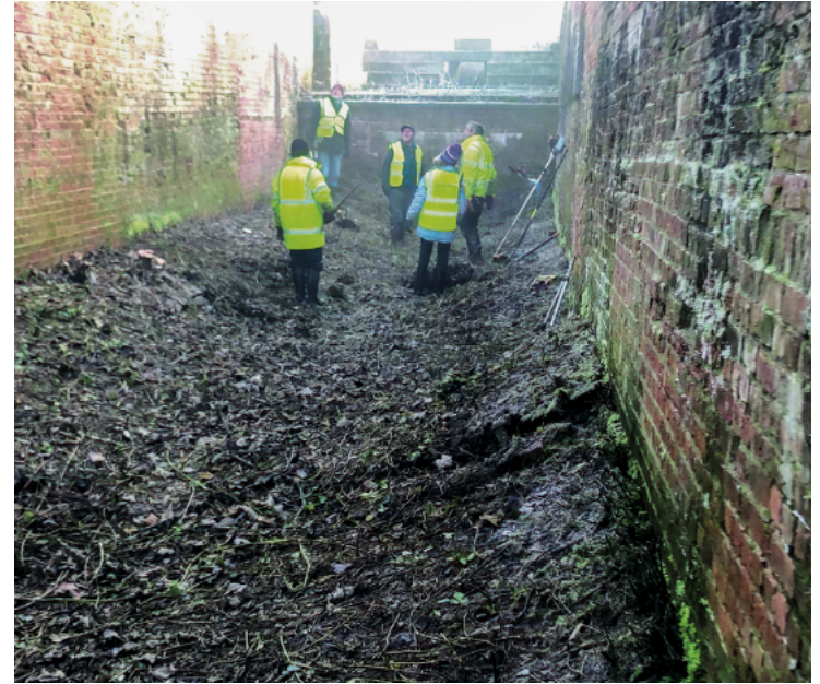
Lock 11 nearly cleared! Great job by the Saturday team who bravely worked through the freezing fog & frost to finish clearing the lock (21 Jan 2023)