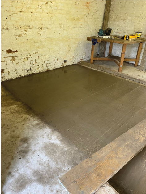
Work on the workshop floor nearing completion - December 2022